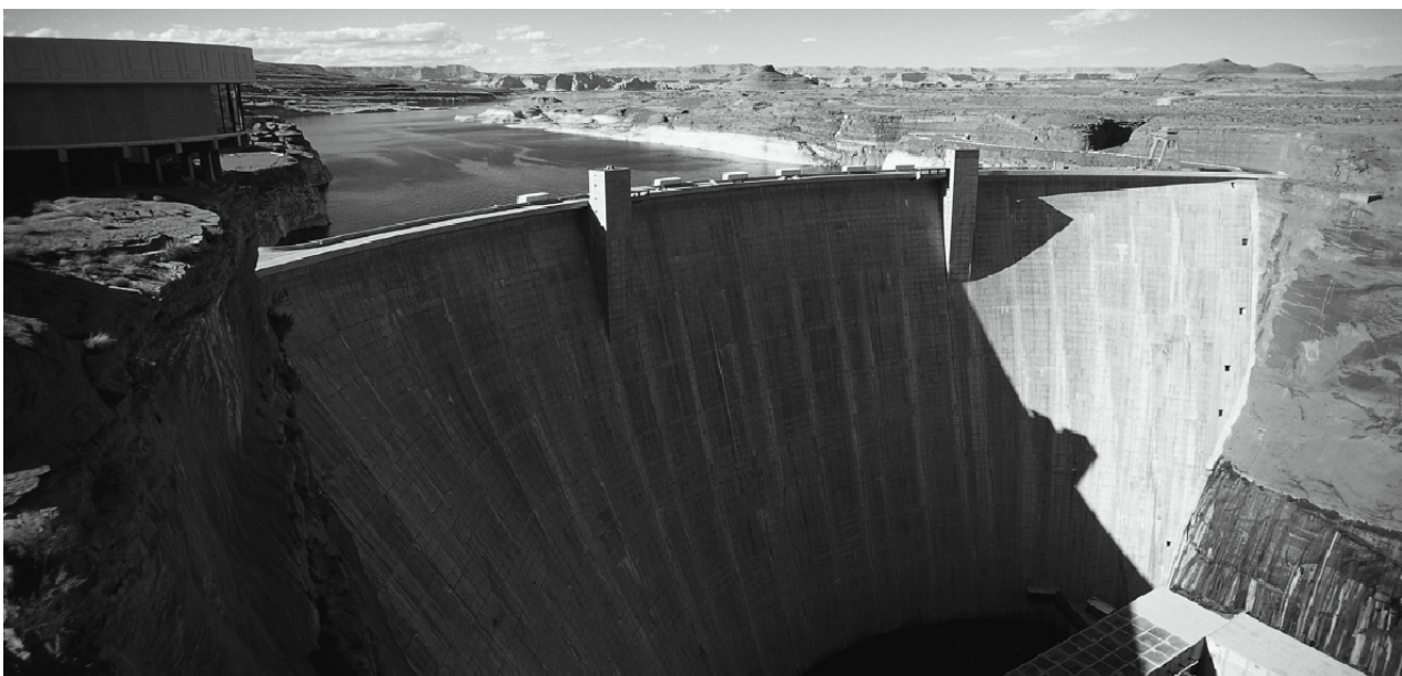
NOTE: MINIMUM LINE ORDER MAY APPLY